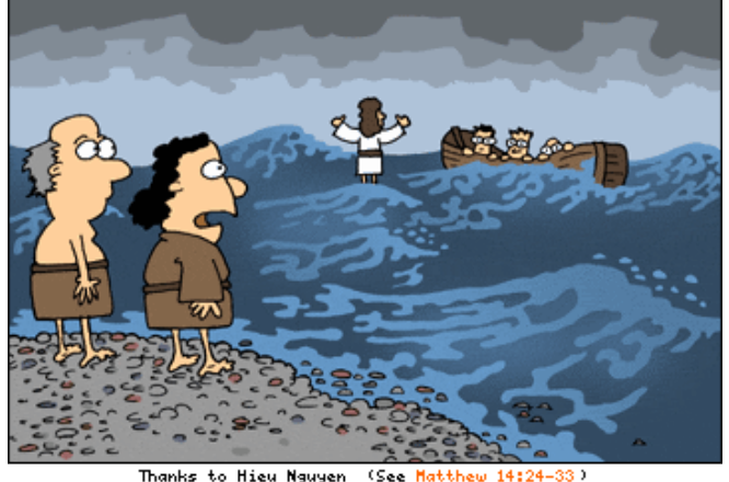
IT'S GOTTA BE THE SANDALS

In 2023 the Union of Catholic Mothers marks 110 years of unbroken service in our parish. This will be celebrated at Mass on Sat14th Oct at 6pm in St John's Church. All past and present members welcome.