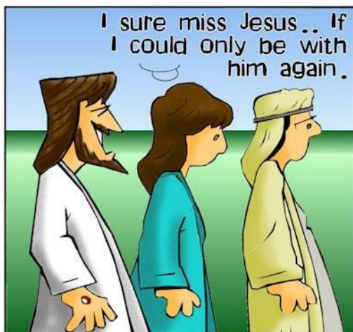
Jesus takes a post resurrection stroll 'incognito' on the road to Emmaus. Luke 24:13-35

Pilgrims of Hope- Jubilee 2025 Pilgrim's Passport: If you want to visit local Pilgrimage sites, we have a family challenge for you. Try to complete our small booklet visiting as many of the places listed and finding the answers to our clues and questions. The Pilgrimage Year lasts until the Feast of the Epiphany 2026 so there is plenty of time. Let us know how you are getting on!